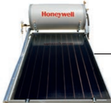
Closed loop – black painted Optimal price / performance ratio