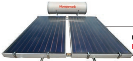
Closed loop – blue selective High end performances

The solar kits can also be used for bigger scale projects by cascading. The collectors can be used/ordered also as stand alone parts. The Honeywell range of solar water heaters can address all the installer and end user needs. From the open loop solution to the closed loop water heaters with black painted collectors, to the high performance closed loop heaters with blue selective panels, there's always the right product for you. The closed loop solar kits can be mounted on flat or tilted roofs.