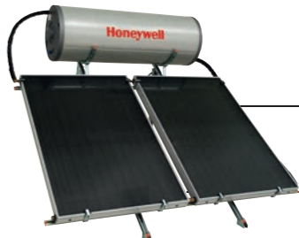
Open loop – black painted Solar energy for everyone