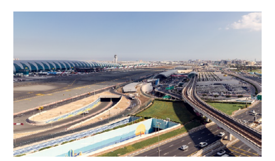
Dubai International Airport, United Arab Emirates

Honeywell empowers airports worldwide to reach optimized operational potential.