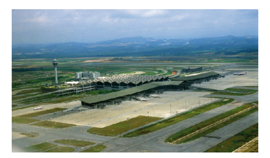
Kuala Lumpur International Airport, Malaysia