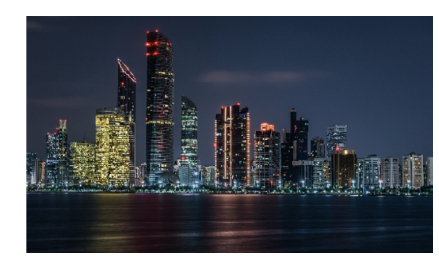
Abu Dhabi Airports Company, United Arab Emirates