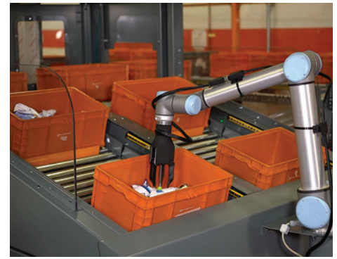
Each picking/item handling

These functions will continue to improve as the speed and processing power of robot control systems increase.