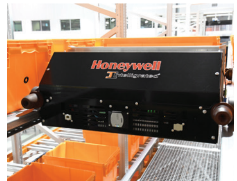
Automated storage and retrieval system

Mixed-SKU depalletizing, which has traditionally been challenging to automate, is now possible, thanks to recent advances in machine learning, perception and gripping technologies. Capable of handling cases ranging in size from a small tissue box to a microwave oven, this solution significantly reduces labor costs and injuries by shifting three to four full-time equivalents (FTEs) per robot out of the depalletizing operation.