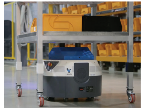
Autonomous mobile robot (AMR)

In situations where trailers transport stacked products of a consistent size, vehicle-mounted articulated arms can do double duty by both loading and unloading trailers. These robots operate quickly and require minimal operator supervision or intervention. There's also no need to change processes or add supporting equipment.