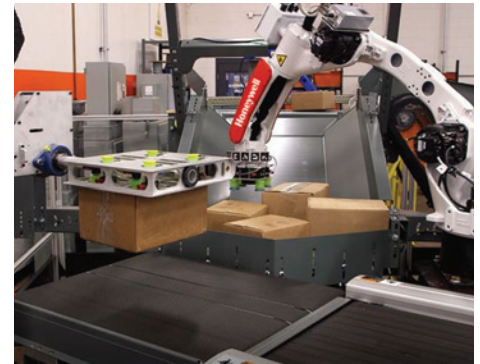
Robotic sorter induction

The system can be implemented quickly, even within existing workflows, and easily integrates with both traditional and mobile automation solutions. Advanced vision technology enables the robots to handle both single-size totes in fixed locations or varied sizes in dynamic positions.